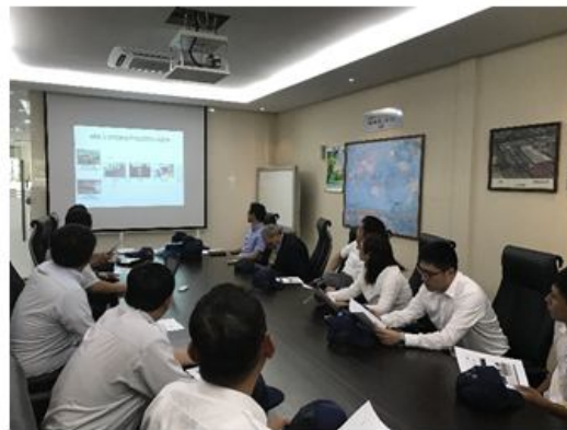
Factory Tour & Presentation by Mill 3