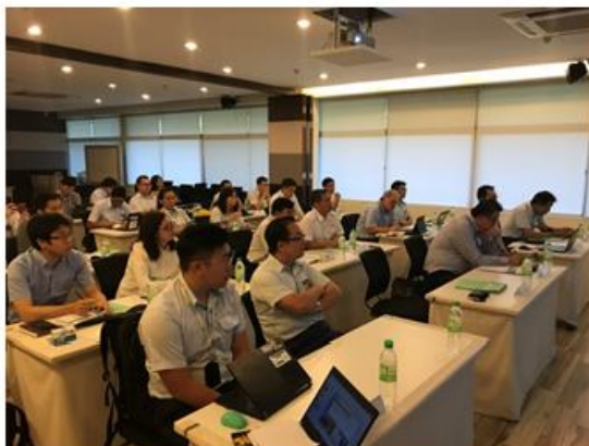
Participants of The 2 nd Oversea ICT Meeting