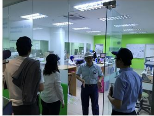
Factory Tour – Mill 4 QC Lab