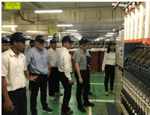
Factory Tour – Mill 1 Operation Area